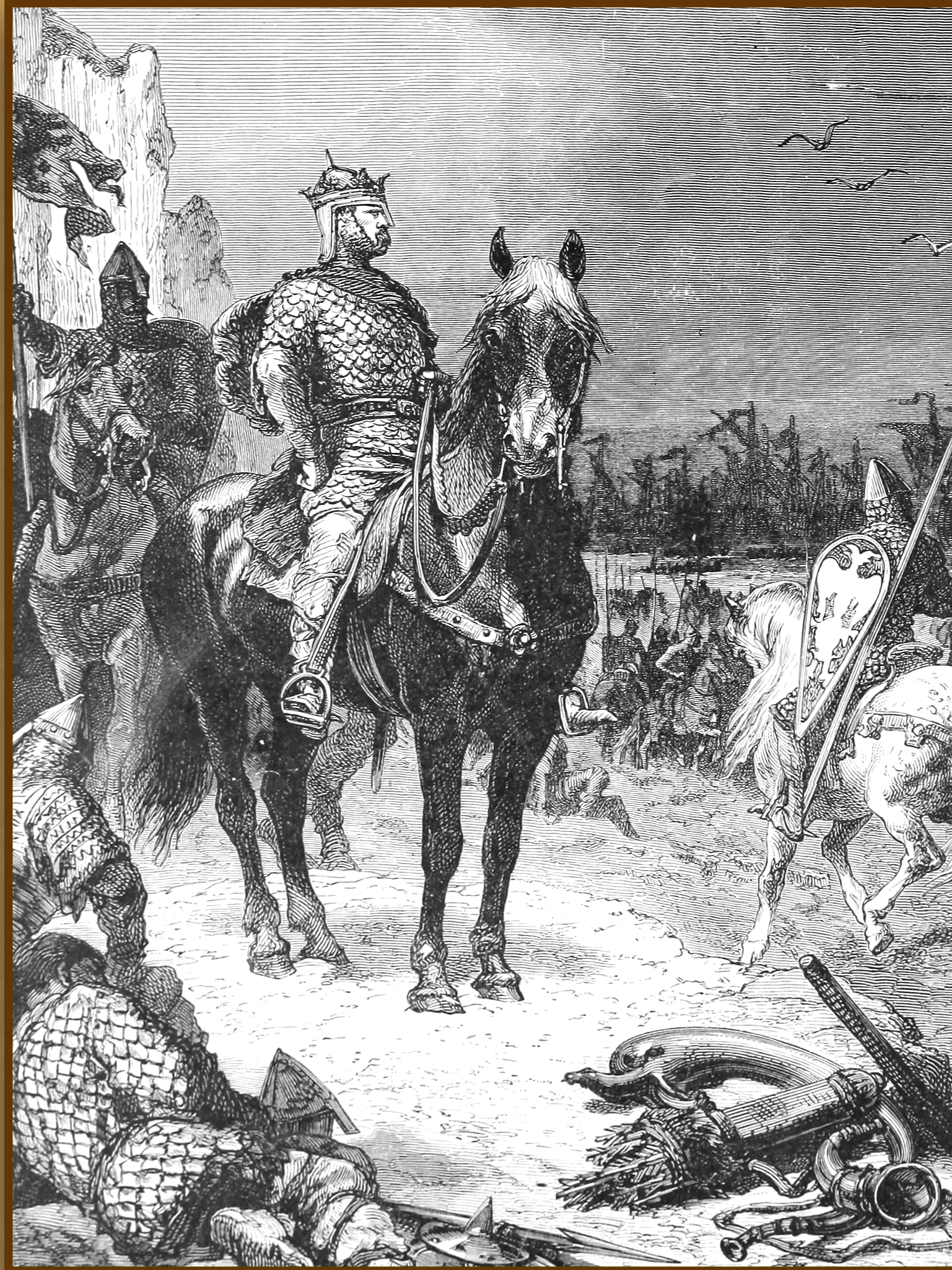
An artist's impression of William after he won the Battle of Hastings

Although William was victorious at the Battle of Hastings, he still faced many problems before he was officially crowned the king of England.